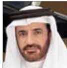
H.E. Mohammed Ben Sulayem President, Automobile and Touring Club of the United Arab Emirates